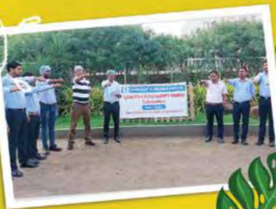
Quality Oath was headed by the Unit head, GM, and QMS head at all divisions