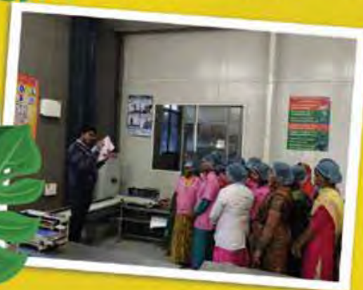
Training and quality awareness sessions were planned by QA heads for creating awareness among staff and workers